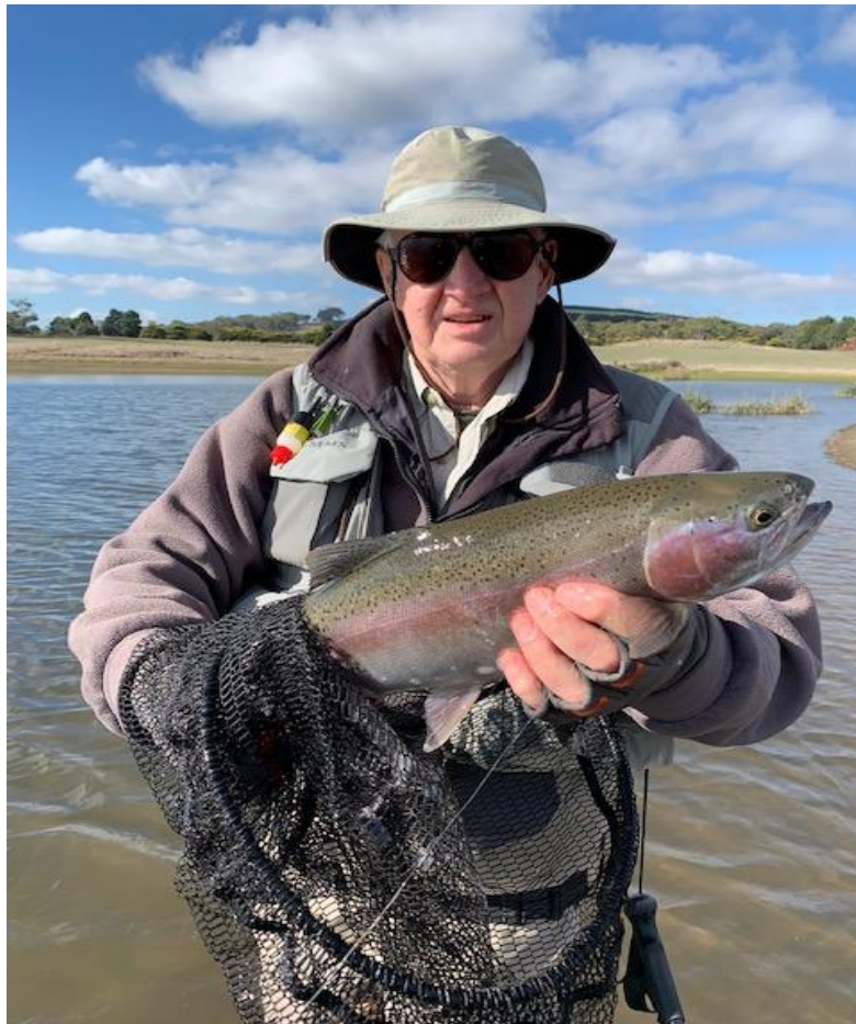
Lynton's Dodger's Rainbow.

Caught on the Black and Silver Midge Pupae below.