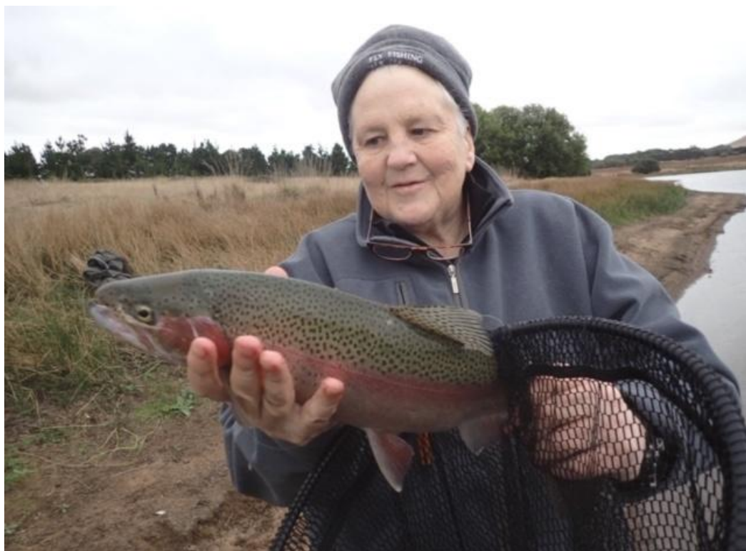
Owen's Dodger's Rainbow caught on a Black, Red Ribbed Size #14 Scruffy Nymph.