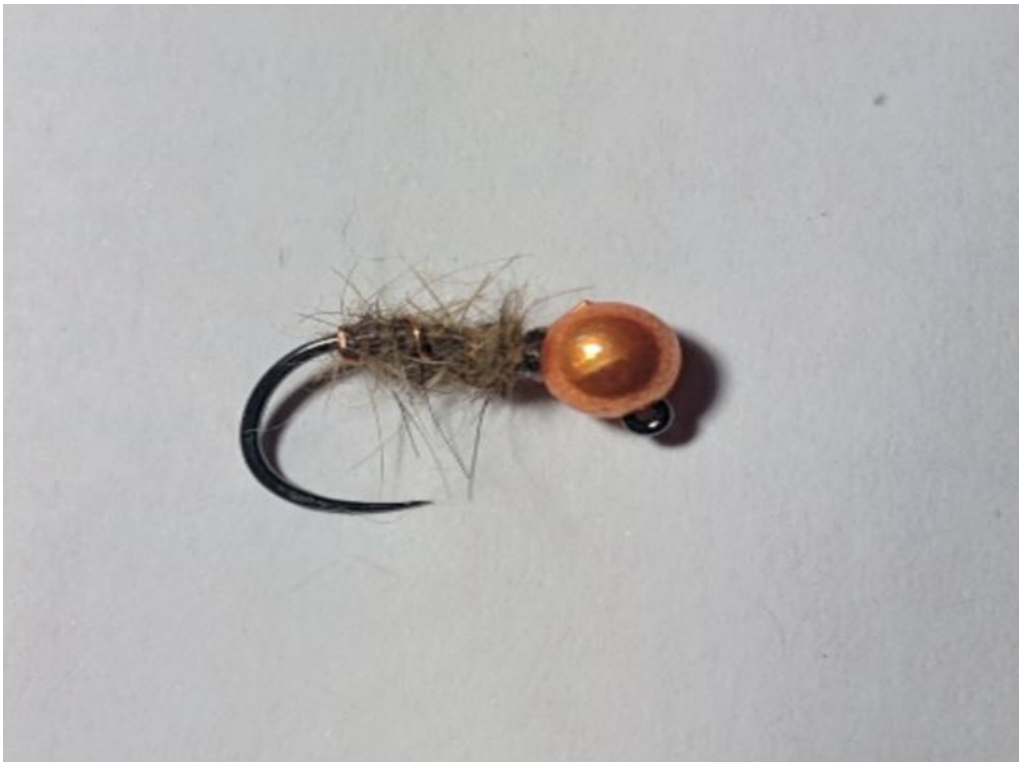
3.5mm Bead Size #16 Hanak Jig Superb Fly Hook.