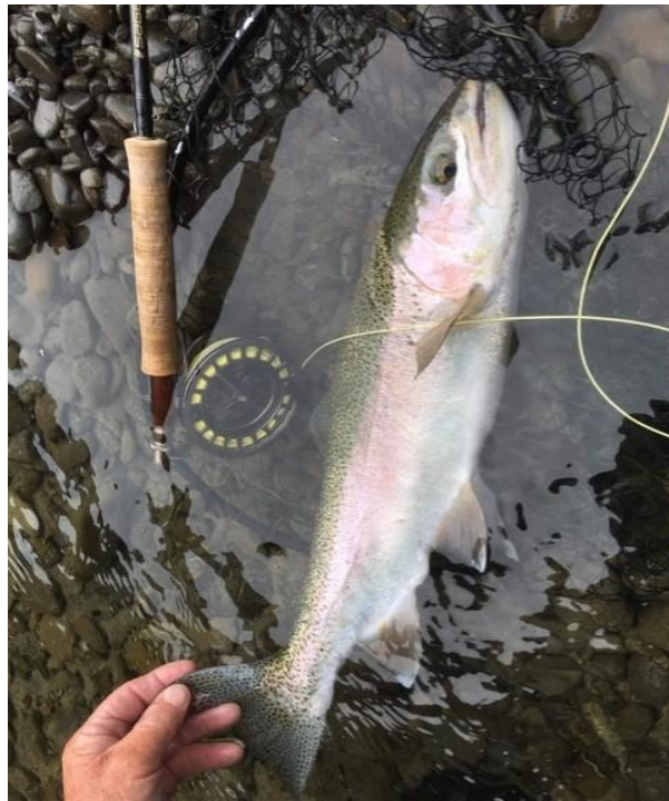
Another Stumpy New Zealand Rainbow